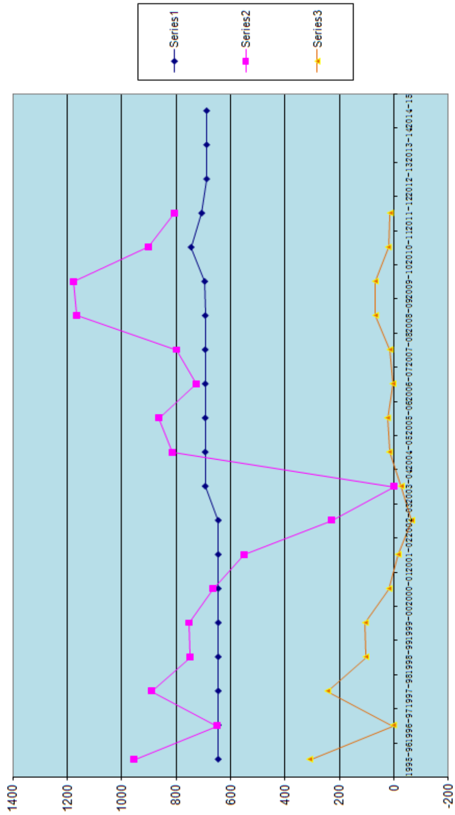
Actual and Normal Rainfall for the year 1995-96 to 2014-15